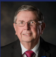
Mayor Darrell Hinnant